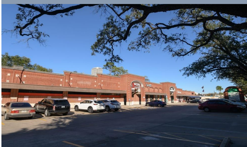
2810 Westheimer Rd — 0.1 mi west of Kirby & Westheimer, in the heart of River Oaks / Upper Kirby

2810 Westheimer Rd · Houston, TX 77098 · Westheimer & Kirby