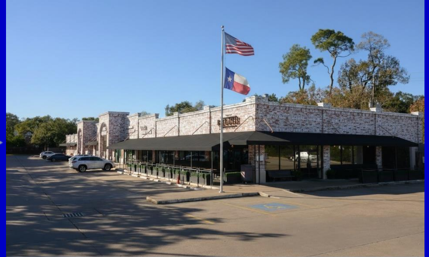
POST-REMODEL — RENDERINGS PENDING