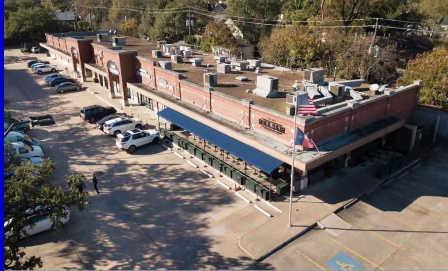
Aerial view — full center footprint, 0.1 mi W of Kirby & Westheimer

RIVER OAKS VILLAGE • 2810 WESTHEIMER RD • 0.1 MI WEST OF KIRBY & WESTHEIMER • HOUSTON, TX 77098