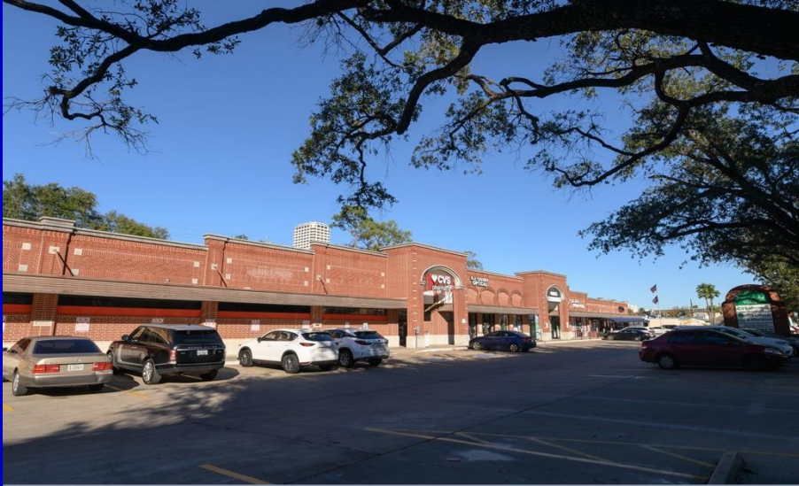
Storefront view — Westheimer frontage & existing façade

2810 Westheimer Rd — storefront & aerial views